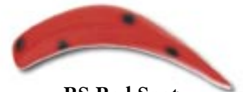
RS Red Spot