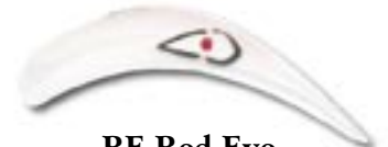
RE Red Eye