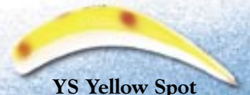
YS Yellow Spot