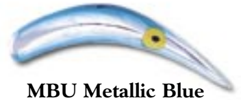
MBU Metallic Blue

Whether it is a walleye, bass or northern pike, many fishermen caught their first fish on a Lazy Ike.