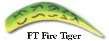
FT Fire Tiger