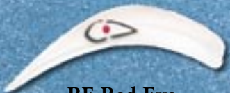
RE Red Eye